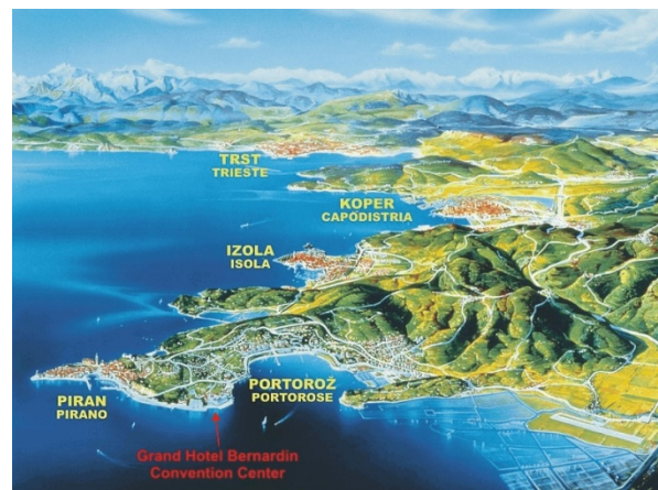
Panorama of the Slovene coast