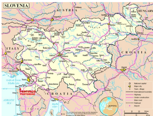
Map of Slovenia